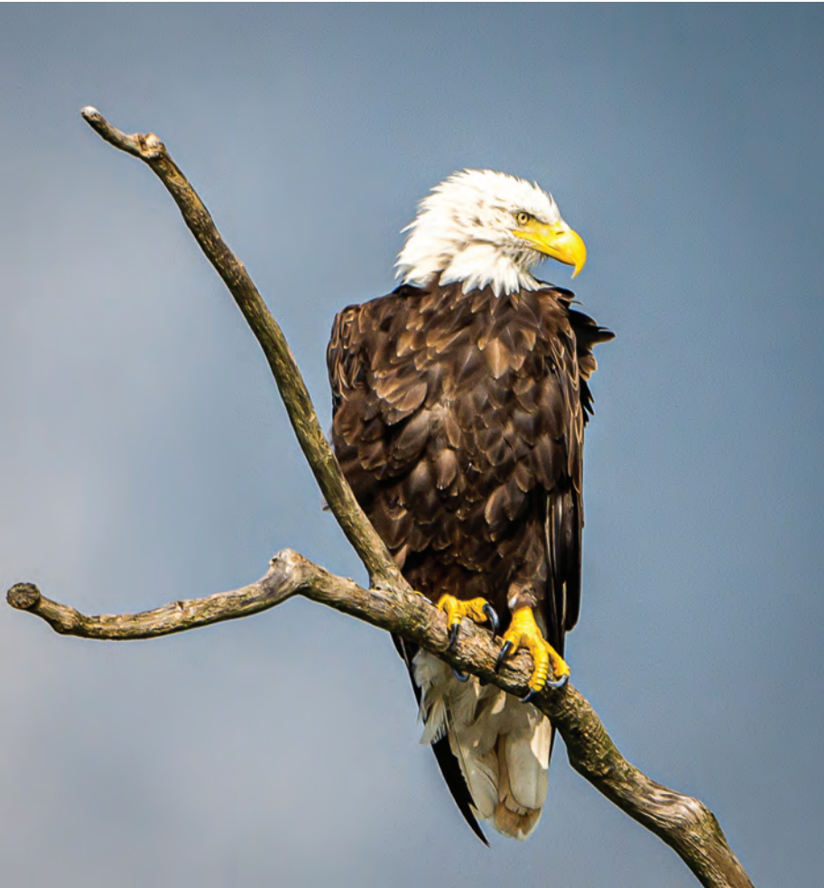
Bald Eagle, Larry Baumgardt

As I write this, the sun is rising over Lake Wawasee on a crisp October morning. The houses along the South Shore are glowing with the “golden windows” effect of the sun reflecting over dark blue Lake Wawasee. The piers are empty and will soon be gone, and the only activity so far this morning is a “fly-by” of one of the bald eagles that nest next door. There is a fire in the fireplace, and I am finishing up my first cup of coffee.