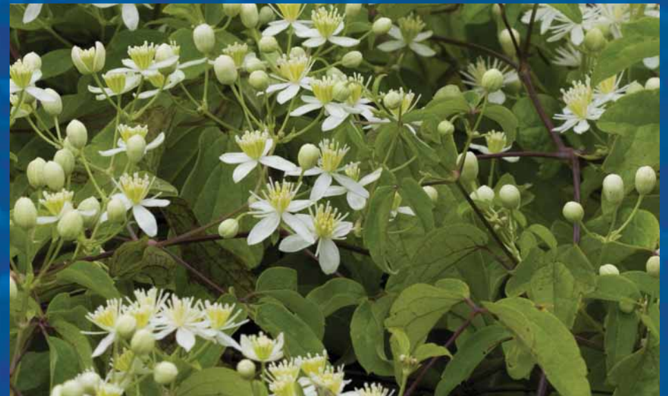
Virgin's Bower ( Clematis virginiana )

Invasive herbaceous plants and native replacements. These species dominate forest floors, roadsides, and lake edges.